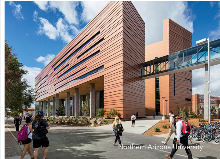
Northern Arizona University